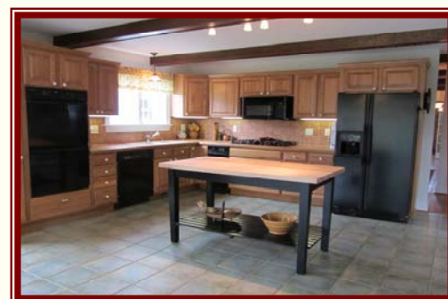
Open beams, top of the line appliances and plenty of room for family and friends.