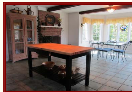
Large kitchen with dining area and views from every window.