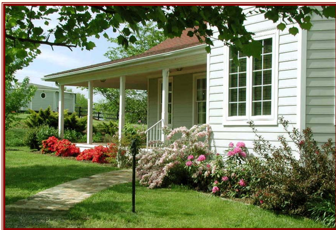
A very private family home thoughtfully designed with wrap around porches and situated on 21 acres in Scottsville.