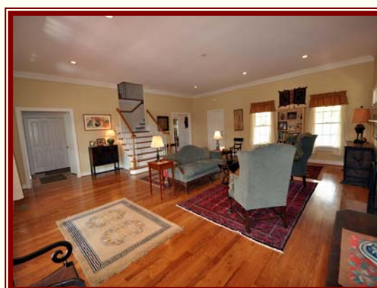
Casual elegance in this living room. Fireplace, lots of light and access to wrap around porch.